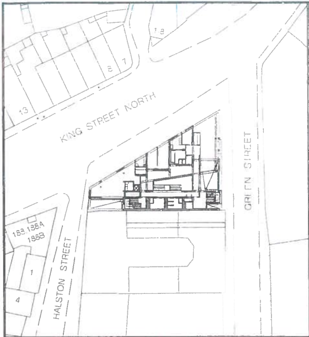
SITE PLAN (SCALE 1:1000)